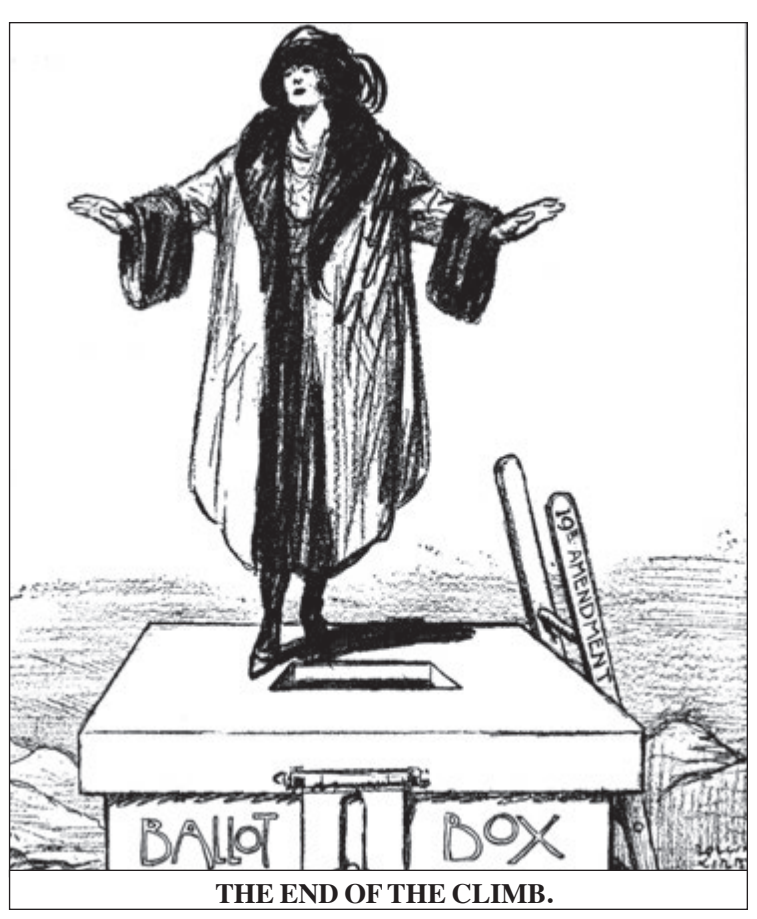
Rollin Kirby/The World